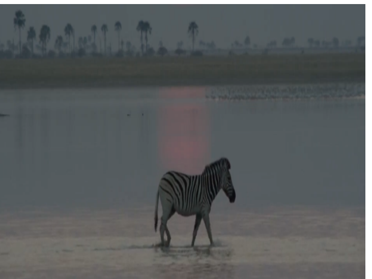
Day or night, we never know what we'll come across! There are photo ops at every turn!!! ... and you never know who you might recognize! :>) ... or not! LOL!!