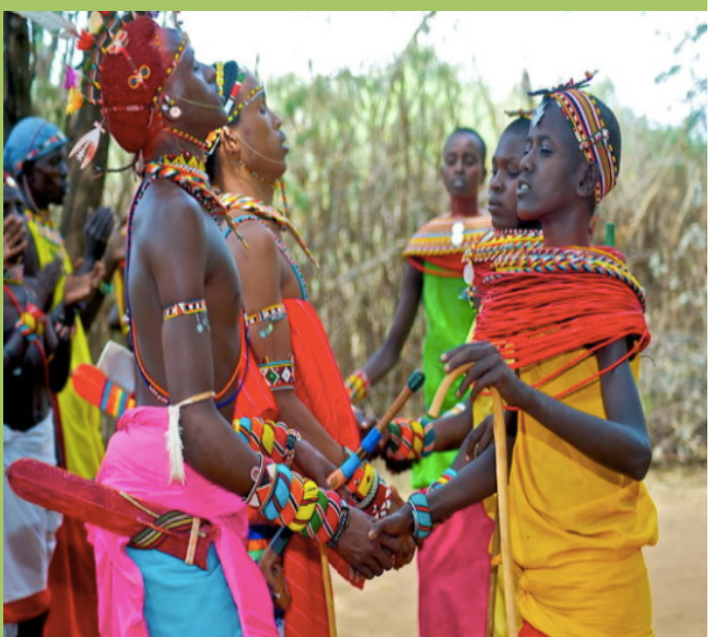
That's it for this week! Keep smiling and do plan to join us in June 2023!!! It's an amazing trip and you won't be disappointed! Do it now, before all that makes Africa, Africa is gone!!!